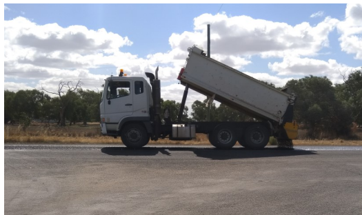
Council's 2021/22 draft budget includes a capital expenditure program of $6.92 million, including $3.07 million towards roads.

Council utilises waste services charges to fully recover the cost of Council's waste services and provide for future rehabilitation costs. Due to the increased cost of kerbside waste and recycling disposal, along with new licencing requirements, waste services charges will increase. The cost of a 140-litre bin will increase to $354 (from $322) and a 240-litre bin to $481 (from $437). The cost for a 240-litre kerbside recycling bin will increase to $134 (from $122).