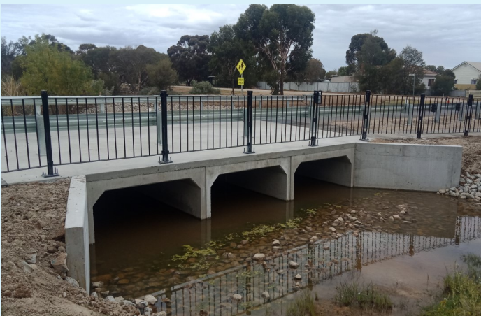
Works are complete on culvert replacement (pictured above) on the Seven Months Creek in Kelly Street, Pyramid Hill.