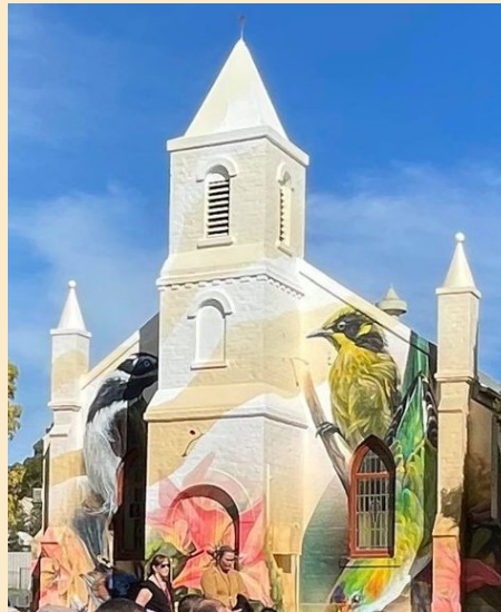
The mural on the Uniting Church at Wedderburn. This is the sixth mural as part of the Wedderburn Open Air Gallery project.

The murals will establish Wedderburn as a linkage between the North East Victoria Silo Art Trail and the Wimmera Mallee Silo Art Trail through the accredited Loddon Visitor Information Centre providing information on both regions.