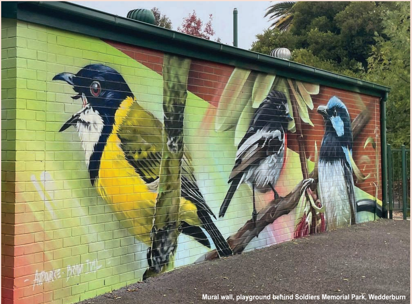
Mural wall, playground behind Soldiers Memorial Park, Wedderburn