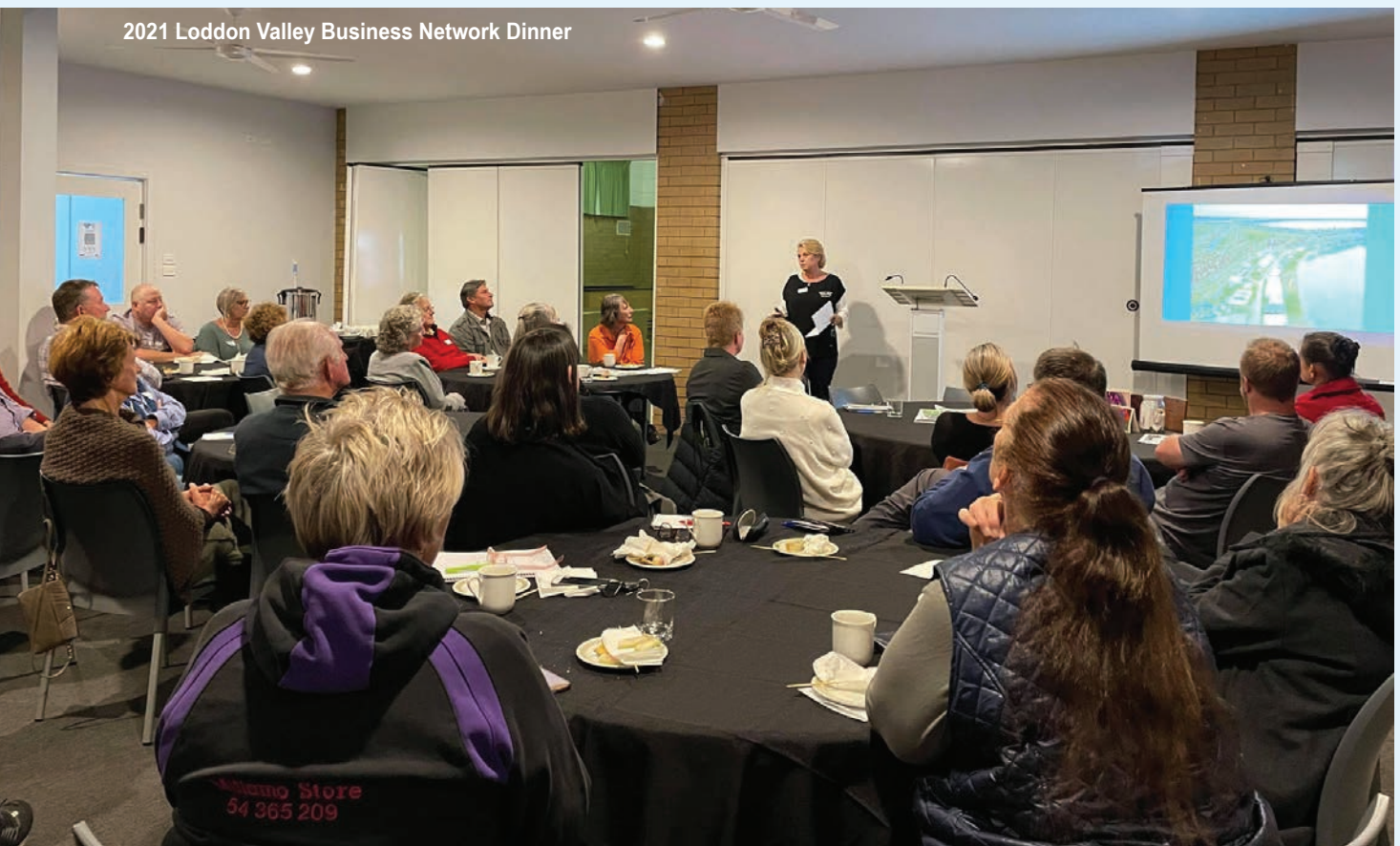
2021 Loddon Valley Business Network Dinner