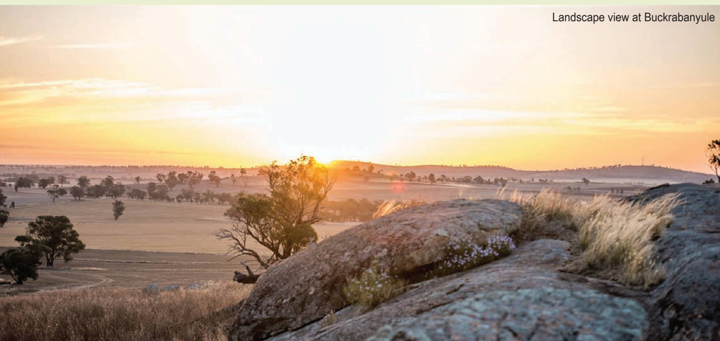
Landscape view at Buckrabanyule