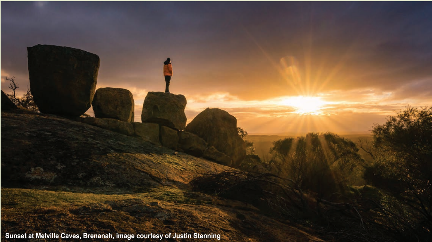
Sunset at Melville Caves, Brenanah