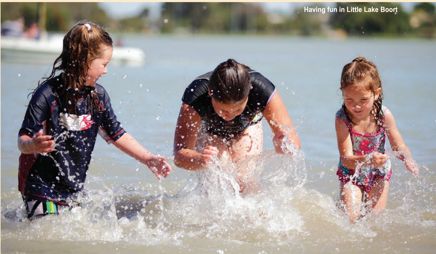
Having fun in Little Lake Boort