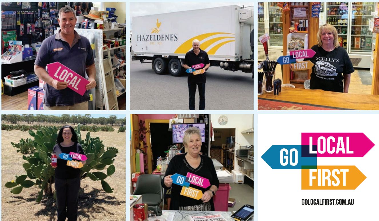
2021 Go Local First campaign