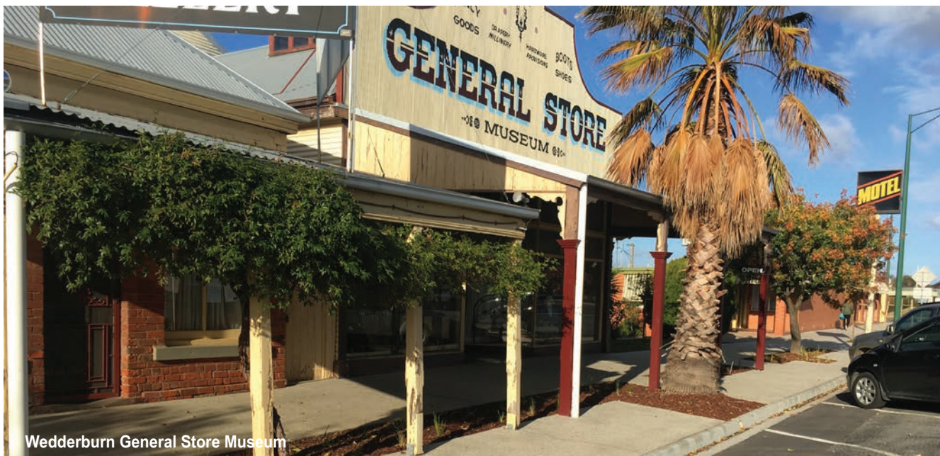
Wedderburn General Store Museum