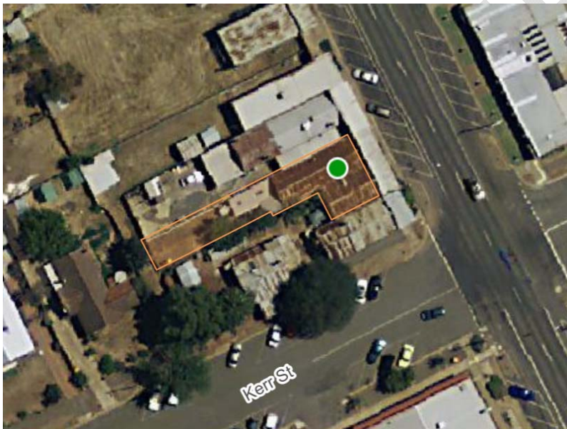
Figure 1: Subject site

The adjoining buildings are currently used as a Fish and Chip Shop (50 High Street) and a vacant retail space (44 High Street). Land to the west (rear) of the subject site consists of a dwelling, next to which is the ambulance accommodation facility.