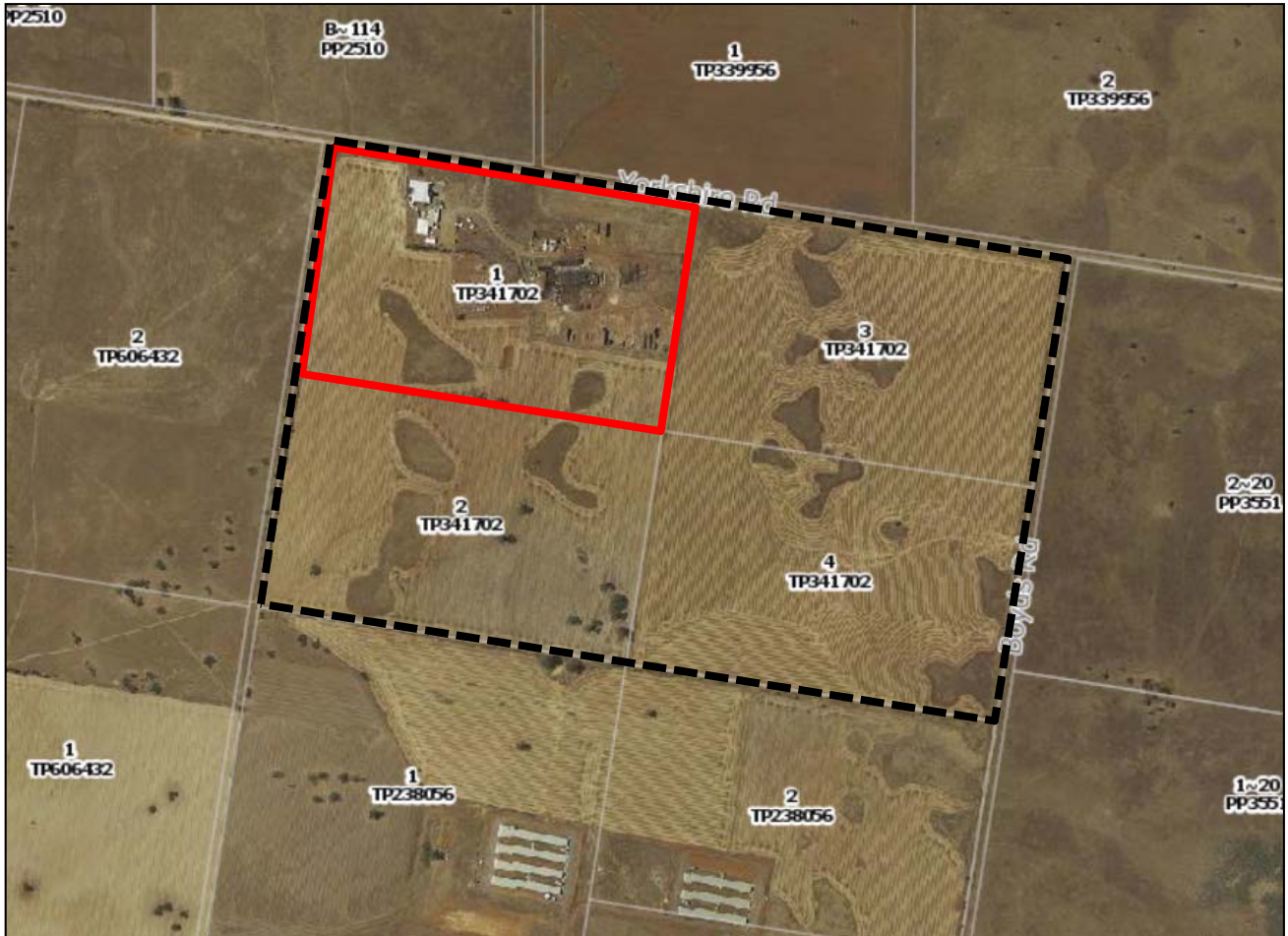
Figure 1: Aerial Photograph