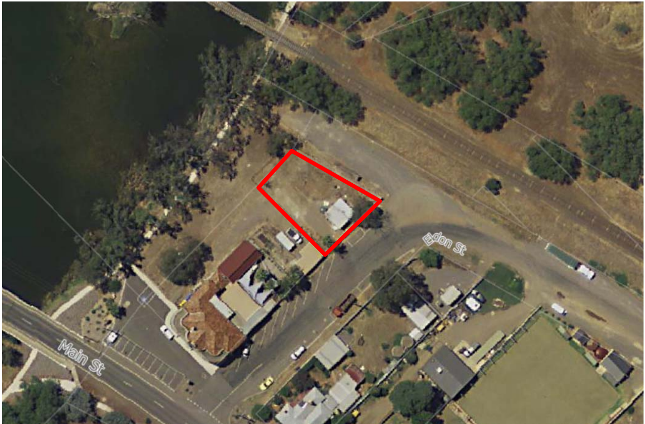
Figure 1: Aerial Photograph