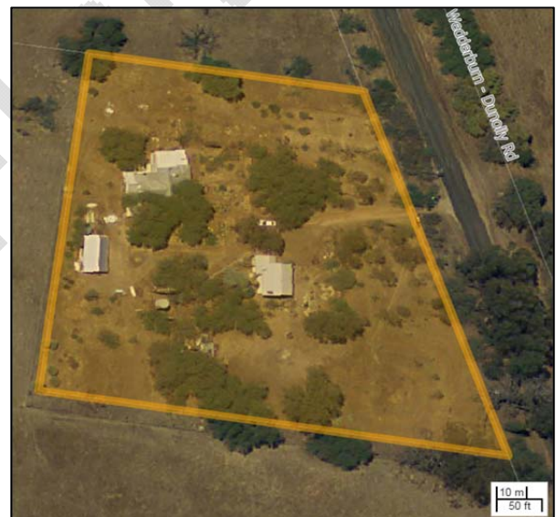
Figure 1: Subject site