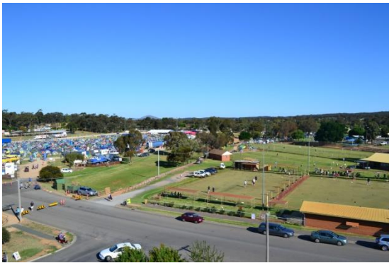
Wedderburn Football Oval

The Loddon Visitor Information Centre attended to 575 walk in visitors on Friday 2 December with each visitor departing with a fridge magnet promoting the Loddon Shire Tourism Region.