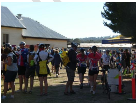
Rheola Sports Ground