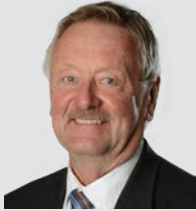
Mayor Cr Gavan Holt

Wedderburn Ward | 0408 943 008 gholt@loddon.vic.gov.au