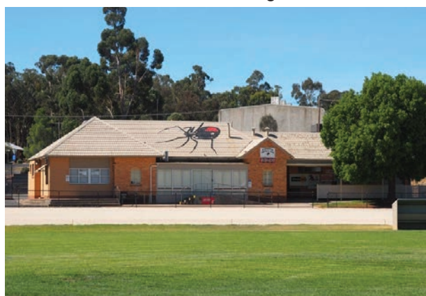
BEFORE AND AFTER: The new Donaldson Park Community Hub (below) replaced the site's ageing pavilions (above).

The Donaldson Park Steering Committee also provided input throughout the project.