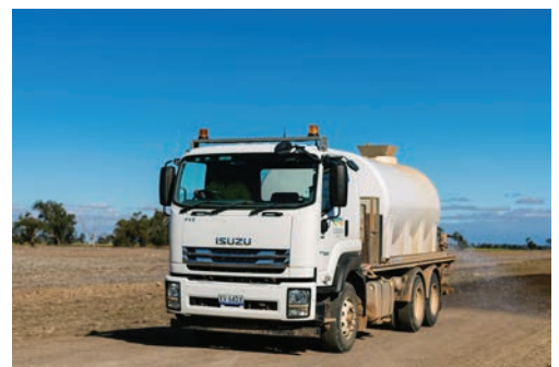
The draft budget allocates a capital expenditure of $7 million, including $3.5 million towards roads.

Council will then consider adoption of these documents at the Council Meeting on Tuesday 25 June 2024 and will give public notice of its decision.