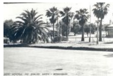
Jacka Park circa 1940-50s