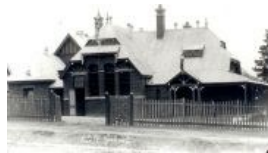
Wedderburn Primary School circa early 1900s

The tours will take in a number of sites in the town, including the former Wedderburn Primary School, old Presbyterian Church, Butterick's House, Wedderburn Community Garden, Jacka Park and more.