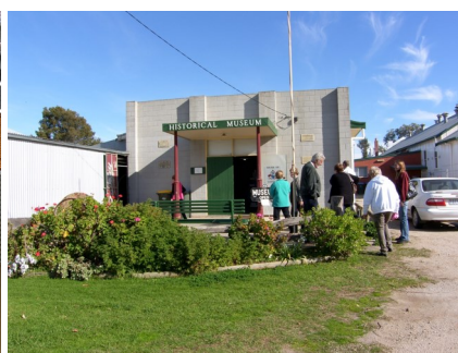
Pyramid Hill and District Historical Society