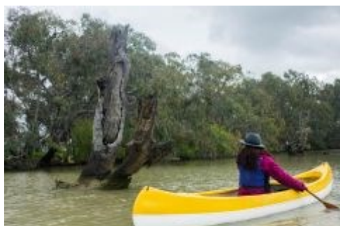
Serpentine Creek Canoe Trail