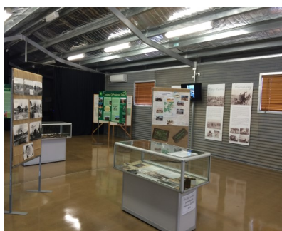
Eucalyptus Distillery Centre Inglewood