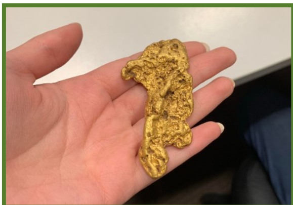
(The nugget cleaned up)

The nugget, first ever found by this lucky prospector, was ten centimetres below the surface. He was surprised by the find as he was searching for coins at the time.