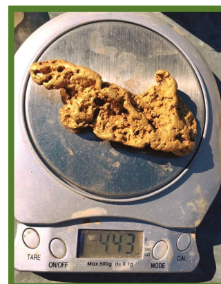
(Weight of the nugget)