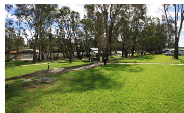
Bridgewater River Track