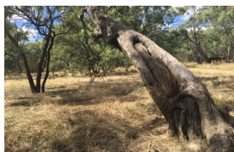
Pon Pon Trail Serpentine