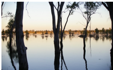
Little Lake Boort Trail

Follow link http://www.loddon.vic.gov.au/Visit/Walking-and-Cycling-Trails for information.