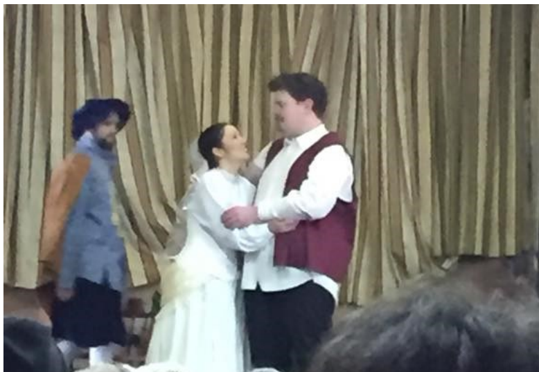
Scene from Mozart's Don Giovanni production