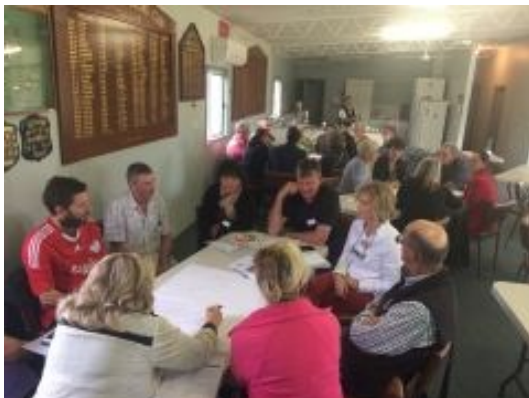
Attendees at the collaboration workshop 4 December 2017