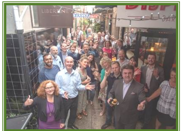
Celebrations in Chancery Lane

A significant representation of tourism businesses and digital mentors attended from across the four shires to celebrate the great success of the program.