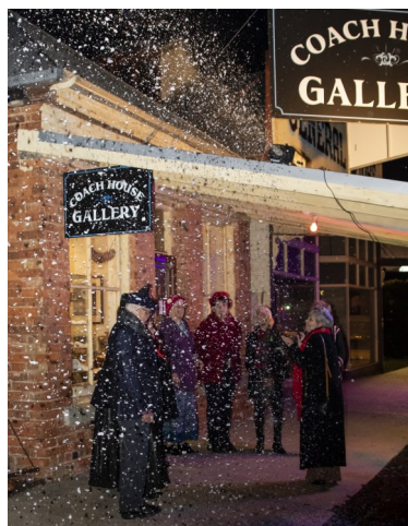
Carol singers enjoying the feel of a white Christmas.