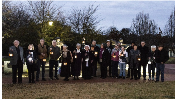
Patrons at the Soldiers Memorial Park ready for their lantern walk to the museum.