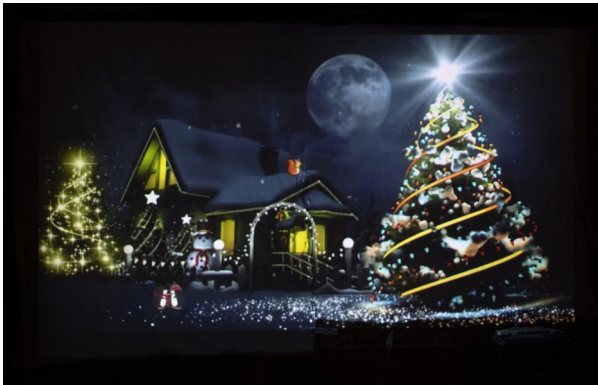
Moving snow scene projected onto the outside wall.

Enjoying the warm fire inside gave everyone the chance to catch up and chat before supper was served.