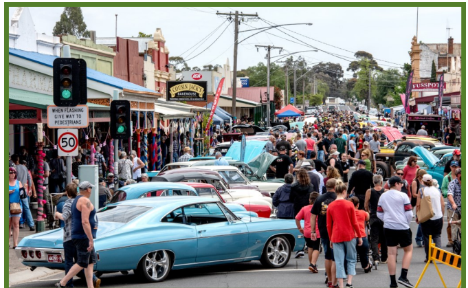
(Inglewood Alive 2018)

Please RSVP for the BBQ to the North Central CMA on (03) 5448 7124 by Thursday 11 April.