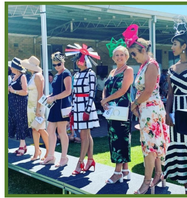
(Fashions on the Field)