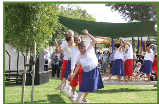
(Sayaw Sa Bangko)