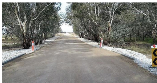
Mitiamo Elmore Road before (left) and after flood recovery restoration works.

Council continues to work in collaboration with government agencies on flood damage restoration projects.