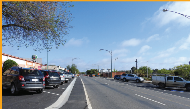
Then (left) and now. The Wedderburn Streetscape Improvement Project has transformed the main street of the town

Works on the Wedderburn Streetscape Improvement Project in High Street has transformed the town, with works anticipated to reach practical completion in February, with landscaping works to follow.