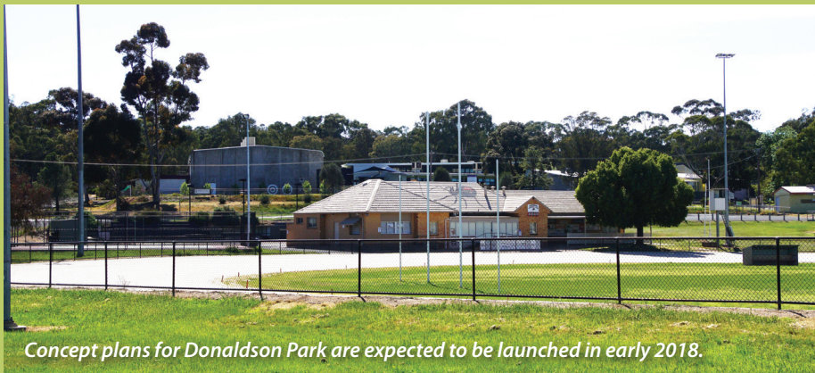
Concept plans for Donaldson Park are expected to be launched in early 2018.