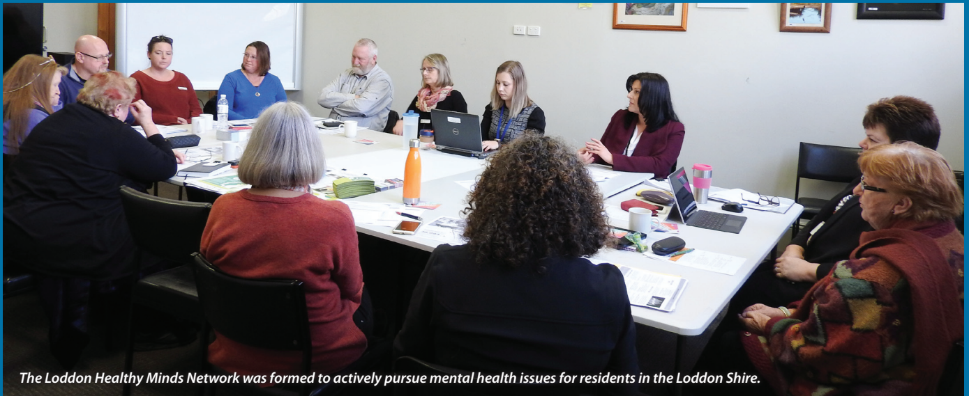
The Loddon Healthy Minds Network was formed to actively pursue mental health issues for residents in the Loddon Shire.

Addressing mental health issues and helping ensure people with mental health issues are represented, continues to be at the heart of the Loddon Healthy Minds Network.