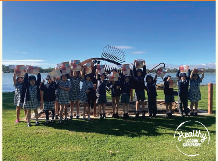
Students from Boort District P-12 School help launch Adventure Bingo.

Residents can participate online by downloading the map via www.loddon.vic.gov.au/Our-Services/Health-and-wellbeing/Healthy-Loddon-Campaspe