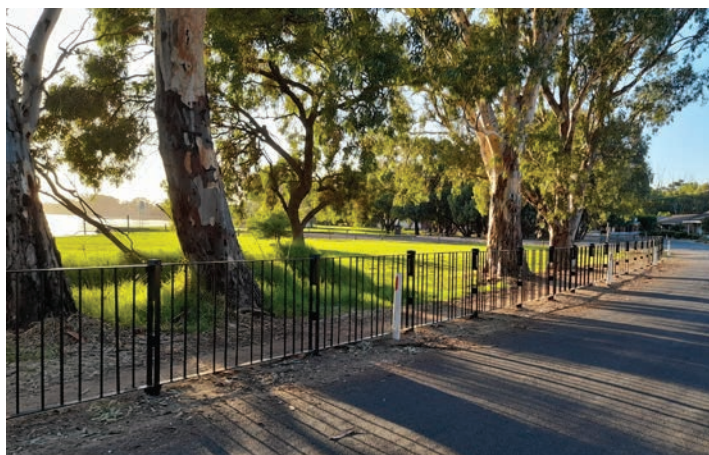
Pedestrian barrier in Lakeside Drive, Boort.

This includes green waste, mixed recyclables, general household waste and e-waste (white goods, TVs, computers, electronic items, etc.).