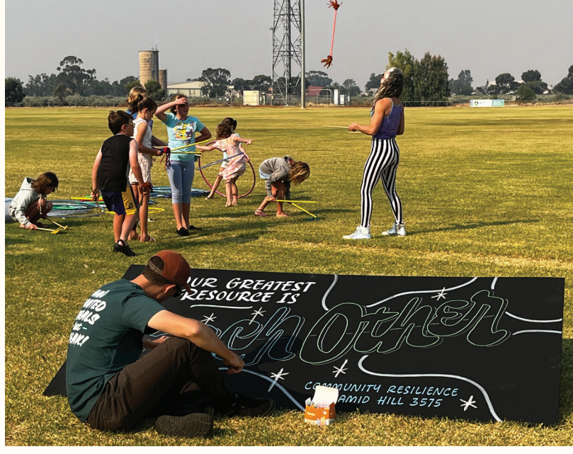
Decorating a chalk mural and learning circus tricks entertained the many children.

Well done to the local organising group and to all those who made it along.